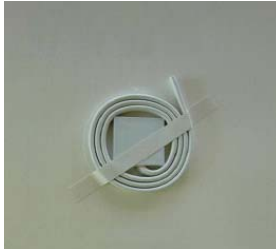
Back View to be placed facing wall

The heater must be installed so the switch cannot be touched by a person in the bath/shower. Stationary appliances without a means of all pole disconnection from the supply must have a disconnect device incorporated into the fixed wiring circuit. The wiring regulations also require a double pole RCD to be installed for all fixed current using appliances in zones 1 & 2 in a bathroom.